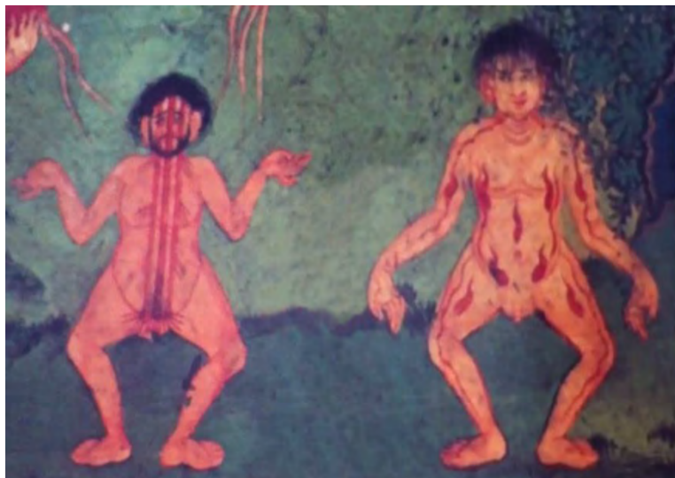
Right: Holding Breath